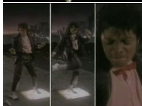
Michael Jackson—Billie Jean