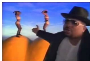
Sir Mix-a-lot—Baby Got Back