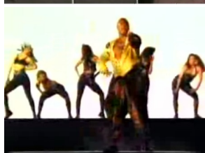
MC Hammer—U Can't Touch This