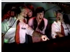
Foo Fighters—Learn to Fly