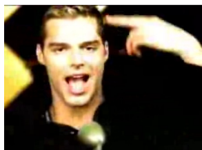
Ricky Martin—Livin' La Vida Loca